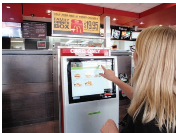
FIG8 NFC enables kiosks for McDonalds.

Of course, not only does this help alleviate the worker issue, it tends to reduce lines