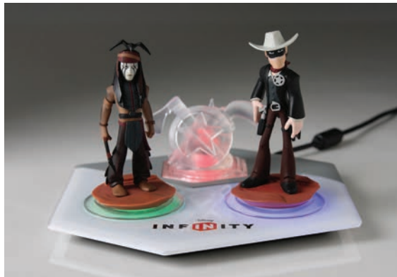
FIG4 The Infinity base station.

Great idea, poor market research. Fairchild did not consider that fact that in the United States at the time, there had been a resurgence of "end-of-the-world" fears. Some fanatical religious groups touted the new technology as a sure indication of the end of times as indicated in the Bible in Revelations 13:16-18 "... a mark on his right hand or forehead, so that no one could buy or sell unless he had the mark ... of the beast." These groups very vocally squashed the idea, and Fairchild decided against releasing a product at that time.