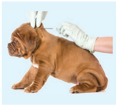
FIG6 Pet tagging.

The Japanese/Hong Kong marketplace widely deployed RFID/NFC use with the Sony Corporation’s FeliCa communication standard. FeliCa is rumored to be a reconfiguration of the Felicity Card first used in Hong Kong by Sony Corporation for Hong Kong’s mass-transit system. FeliCa uses the underlying antenna/field generator (reader/writer) of RFID; then it incorporated a proprietary communication protocol including encryption for use as a mobile payment system. This early version of FeliCa used 13.56 MHz as the field frequency with a communication rate of 212 or 424 kb/s. Figure 7 shows one of the common uses of FeliCa card systems.