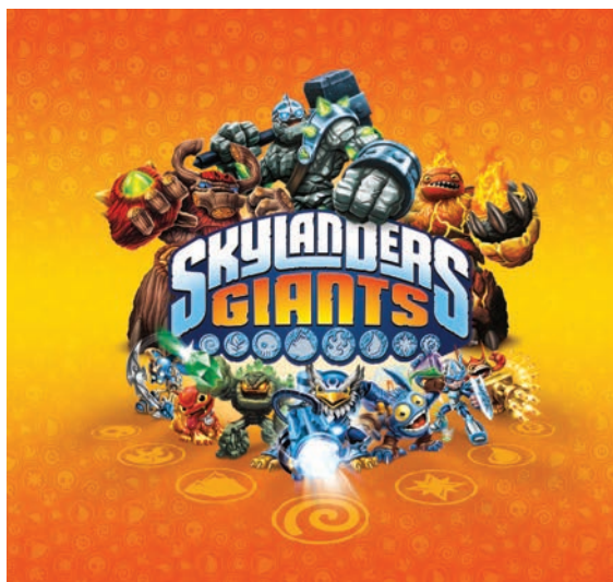
FIG2 Skylanders .

Disney saw how much money Activision was making with its RFID-based gaming and, as it had just completed a major overhaul putting RFID tracking systems into all of its amusement parks, it decided it was time to move into the active gaming