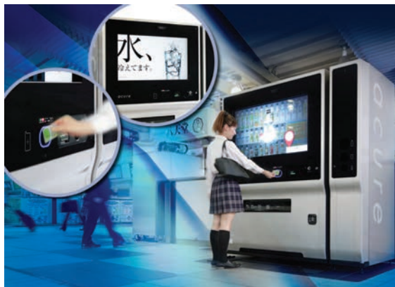
FIG7 A student uses FeliCa with a soda machine.

Related to NFC, there is also the international standard ISO/IEC 21481 (NFCIP-2). This standard covers NFCIP-1, ISO/IEC 14443, and ISO/IEC 15693. Although ISO/IEC 15693 uses the same frequency as the other standards, it is mainly applied to RFID tags used for products and logistics management. ISO/IEC 15693 is not included in the specifications defined by the NFC Forum at the moment.