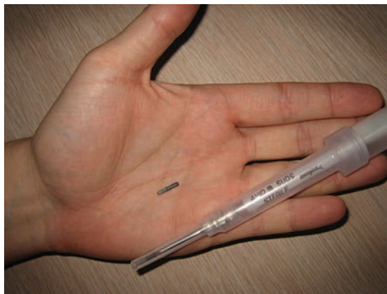
FIG5 An RFID sensor can be injected into a hand.