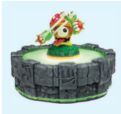
FIG3 Skylanders ' Portal of Power.

The Disney Infinity system is unique in that it does not need to create a storyline like Activision did with Skylanders , as it already has hundreds of storylines, from its franchises including Mickey Mouse, Pirates of the Caribbean , and The Incredibles , as well as a slew of Marvel superheroes including Spider-Man. In the two years of gaming operation, it has surpassed US$2 billion in sales as well as boosted its movie rentals and purchases. As the children play with the figures in the gaming world, they ask their parents to re-watch the stories that they are playing, and the money keeps printing itself for Disney.