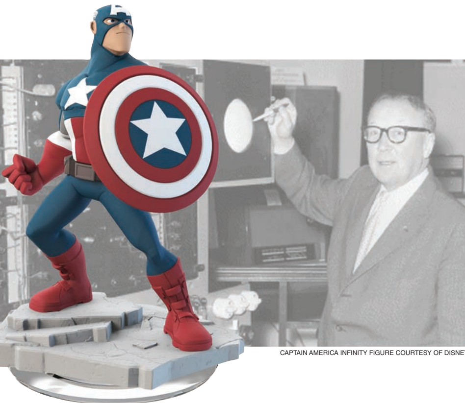
CAPTAIN AMERICA INFINITY FIGURE

licensed the technology to Schlage, a lock maker, and other companies.